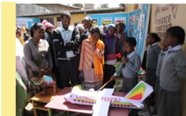
Children showing off their inventions at a school competition

Community Savings Groups: 33 microfinance groups formed this year, with 330 members in groups of 8-10