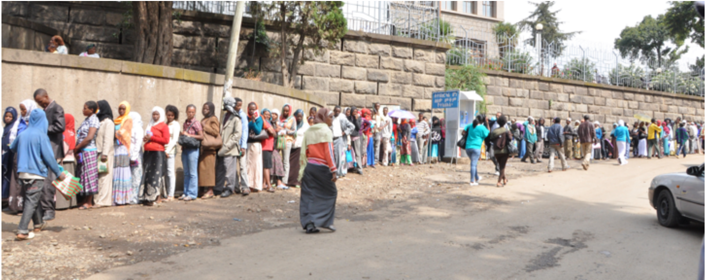
Women line up for months at the Immigration Office in Addis Ababa to obtain a passport & visa that allows them entry into the Middle East where they often end up enslaved.