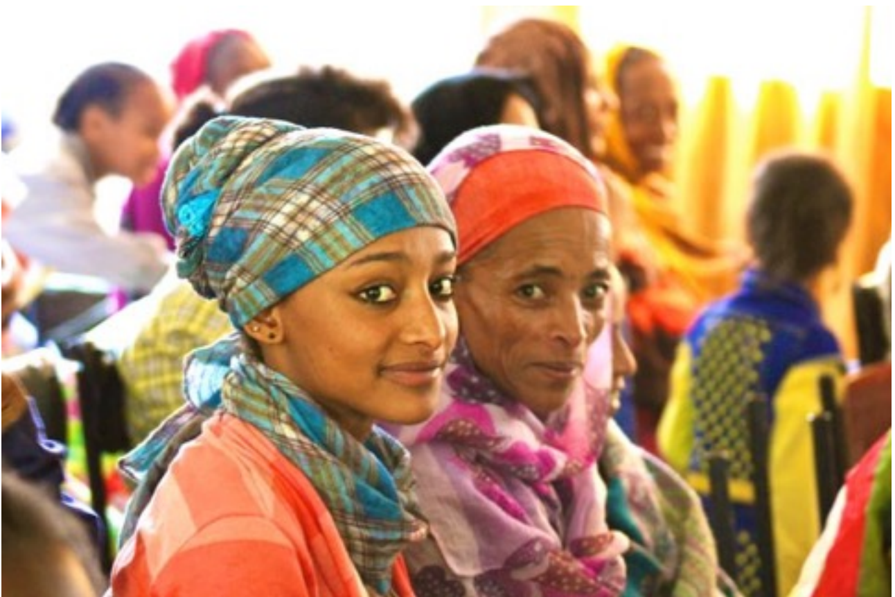
Two family members watch on at the annual awards ceremony at the end of the school year.

HFC has been focussing its strategic efforts to develop and integrate sustainable developmental and livelihood initiatives and programs across the organisations. Next project year we will expand our livelihood activities across our child focused activities but for this reporting period our key intervention in the livelihood area was the Women and Child Livelihood Program.