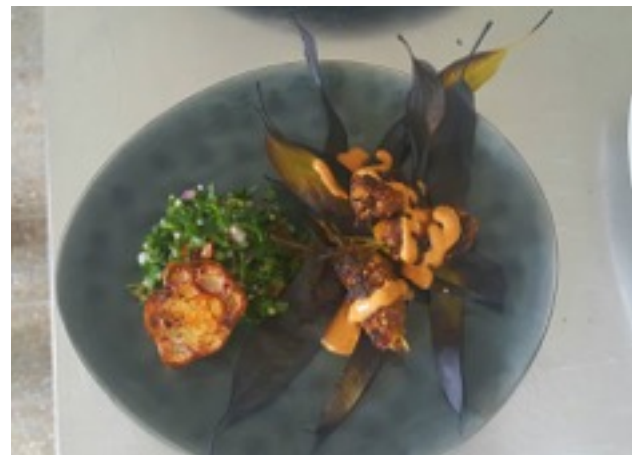
The Bahir Zaf logo, along with two dishes- Nile Perch with Ratatouille (top) and Lamb Kofta with Berbere Yoghurt Sauce.

At the beginning of the reporting period, Hope for Children partnered with local business Walkan Foods to open an exciting new social enterprise restaurant project in Addis Ababa. 'Bahir Zaf' is a local training restaurant, taking some of Addis Ababa's most disadvantaged youth, and putting them through 12 months of on-the-job training in hygiene, food preparation, customer service and English. After one year of training and practical experience in a fully operating restaurant, students are supported to find work in Ethiopia's booming hospitality industry. Based on a sustainable business model, 100% of profits will be directed back into training or community projects across the country. In the local Amharic language, 'Bahir Zaf' means eucalyptus tree. The Hope for Children community in Ethiopia chose the name Bahir Zaf (literally "ocean tree") because the eucalyptus is a local symbol of international friendship.