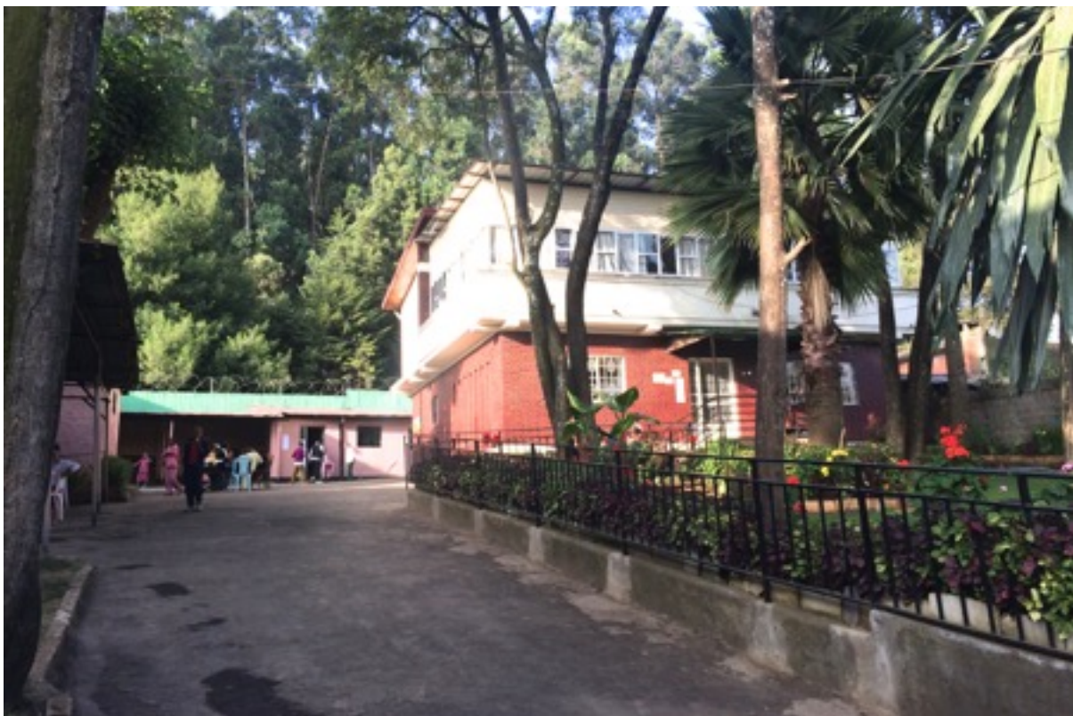
Our spacious, leafy green new Head Office. Children sit outside to do group activities.